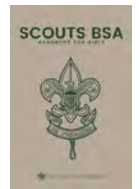
Scouts BSA for Girls